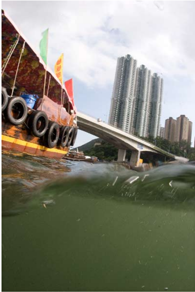
Aberdeen Harbour. N 22°14.790', E 114°09.579'