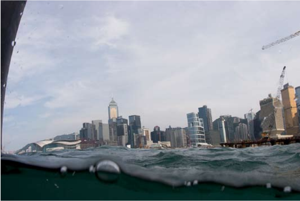
Hong Kong Island, Pier 9. N 22°17.163', E 114°09.770'