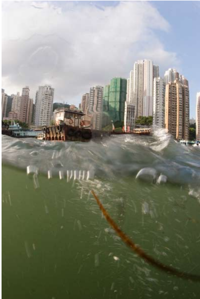
Aberdeen Island. N 22°14.716', E 114°09.354'